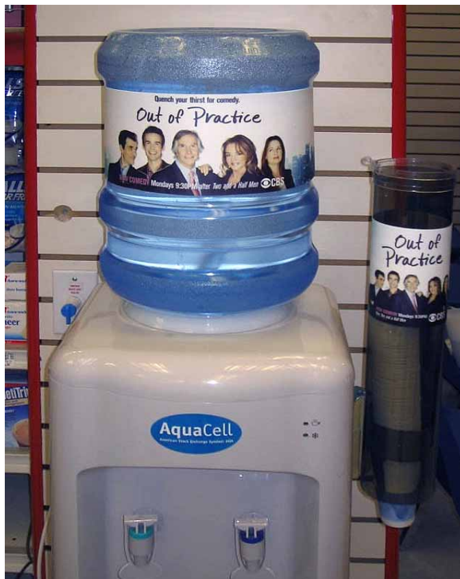
CBS advertises on water coolers manufactured and placed by AquaCell. This one is in a drug store.

Back to AquaCell. There is another connection to the imaging industry: AquaCell has figured out how to use the water cooler as an advertising medium. Early placements have been in big-chain retailers. The Rite Aid and Duane Reade drug-store chains and the Winn Dixie grocery store chain have signed up. Hair salons and law offices are being targeted, as well. Unilever, the giant manufacturer of food, home-care, and personal-care products and broadcaster CBS are current advertisers. Unilever is promoting Dove Cool Moisture soap and lotion. (I think it's soap. The Unilever web site calls it a "beauty bar.") CBS promoted its "Out of Practice" TV show initially, and now is promoting "Courting Alex." The advertisements themselves are printed by Identagraphix, Inc. (Walnut, CA), using an HP DesignJet 5500, and "wrapped" around the plastic bottle. p